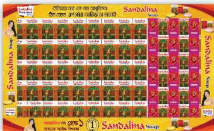
Sandalina Display Program