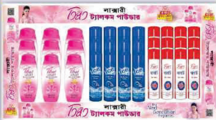
Summer Display Program